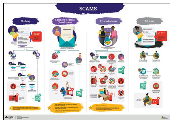
Figure 1 Scams poster