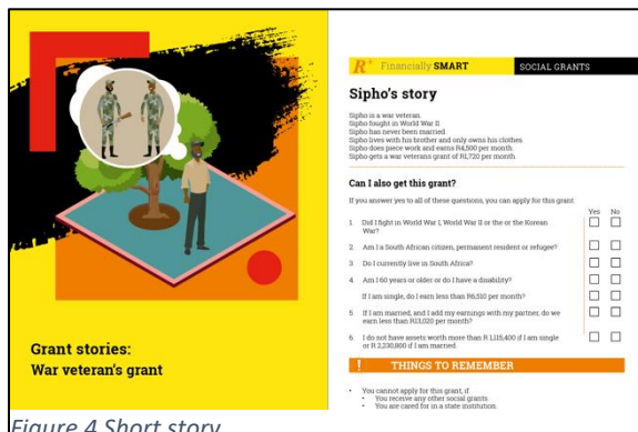
Figure 4 Short story