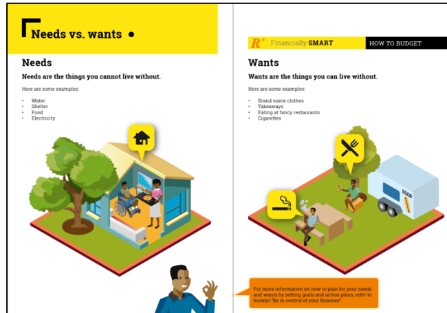
Figure 5 Visualised concept