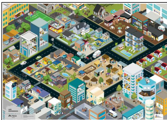
Figure 2 Life Experiences environmental map